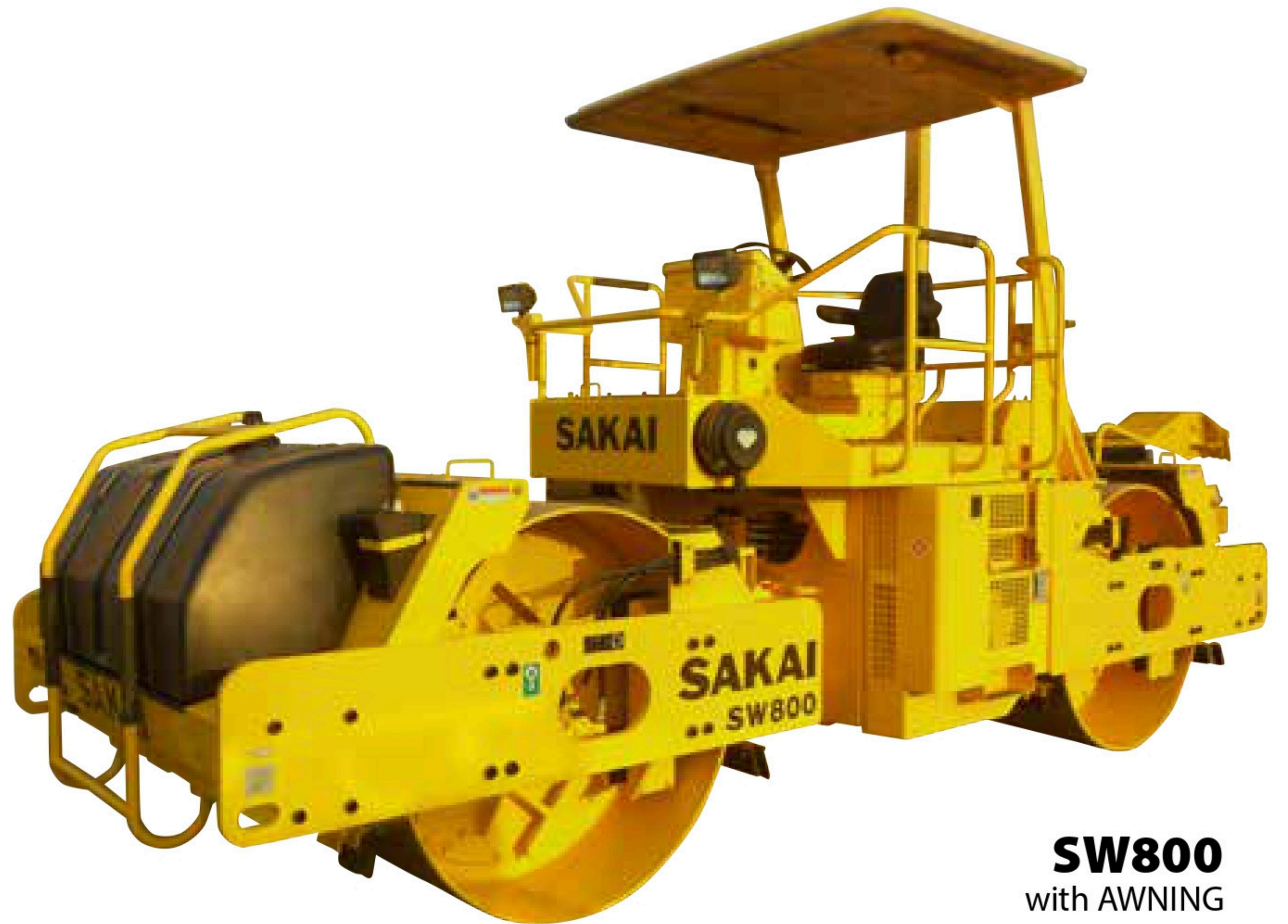
SW800 with AWNING