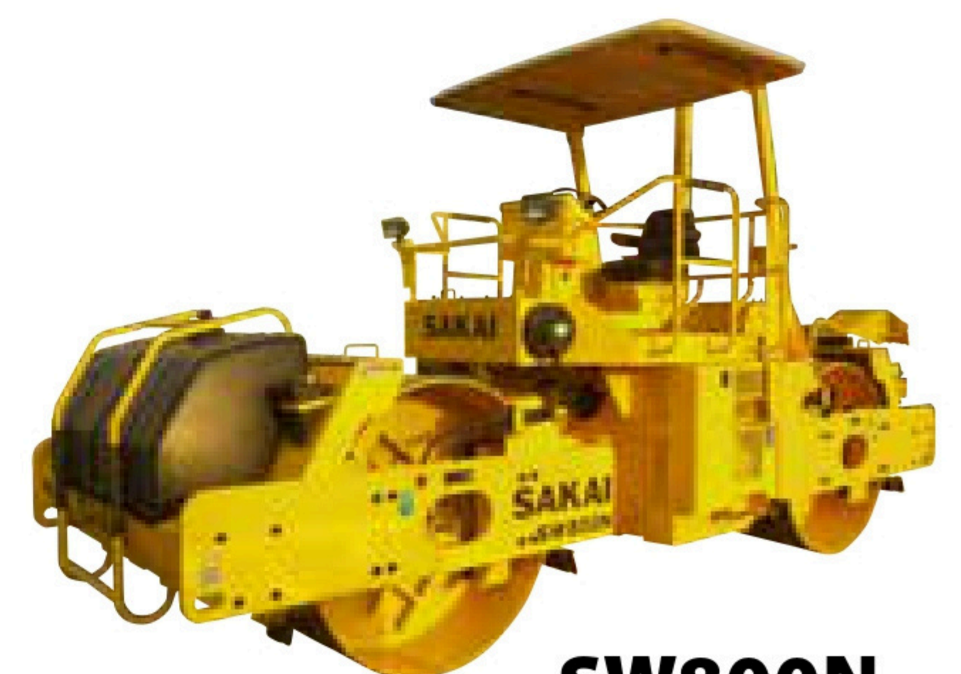
SW800N with AWNING